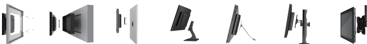
Embedded installation Embedded installation Wall mounted installation Desktop installation Louver installation Cantilever installation Boom type installation